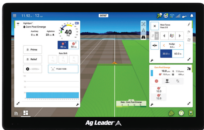
Controlled on the InCommand® Go 16